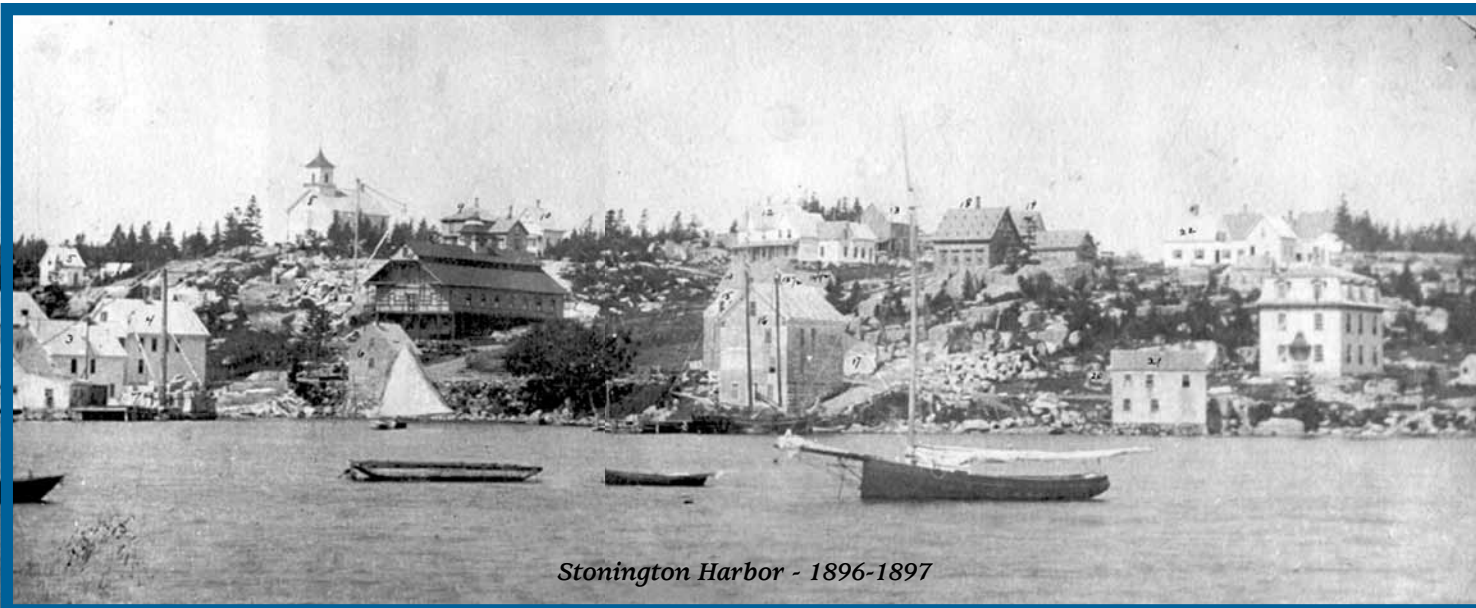
Stonington Harbor - 1896-1897

D eer Isle is a beautiful island community of 24,000 acres and 112 miles of shoreline, comprising the towns of Deer Isle and Stonington, and outlying islands. It is a group of small communities with 2,400 residents that make up the year round population. Lobstering is the current mainstay of the Island.